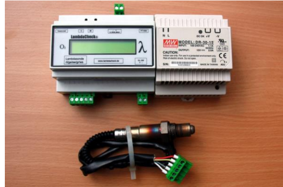
Picture2 view of the complete system

The module is shown in Fig.1. It is mounted on a DIN rail.